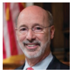
GOVERNOR TOM WOLF