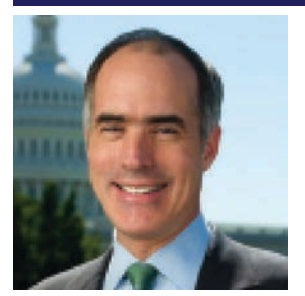
SENATOR ROBERT CASEY